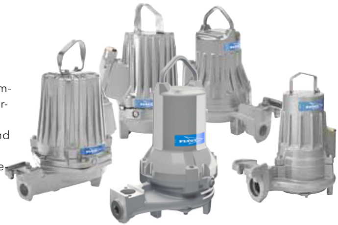
Pump capacity, 50 Hz

Based on a flexible, modular design, the Flygt grinder pump range cover an extensive performance range. These submersible single-stage centrifugal pumps share the same discharge diameter, which makes it easy to select one of the interchangeable impellers to precisely match your head and flow requirements now – and easily change it later. High efficiency minimizes electrical equipment installation costs and subsequent energy consumption.