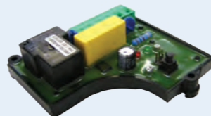
Presflo's resin bonded electronic circuit board